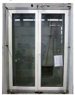
Instructions for use

The results obtained can be used by the manufacturer for preparing the Declaration of Performance in accordance with the Construction Products Regulation 305/2011/EU. The provisions of the applicable product standard have to be observed.